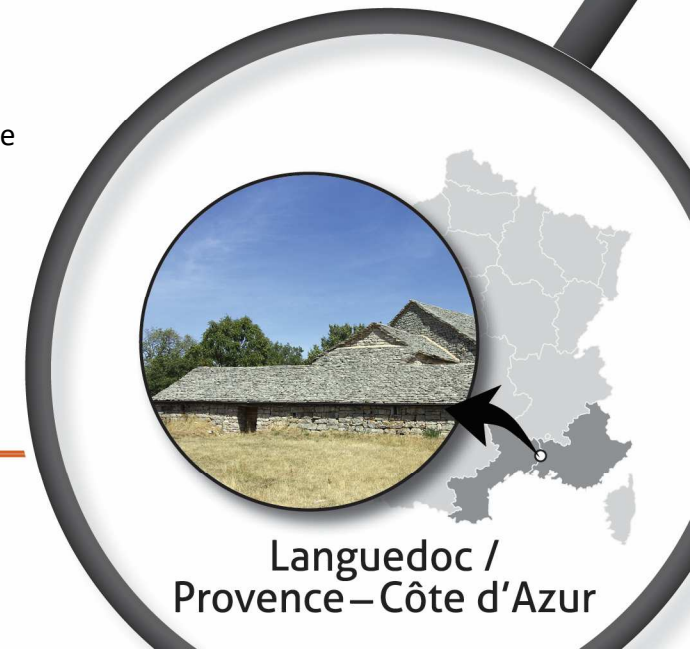
Languedoc / Provence – Côte d'Azur