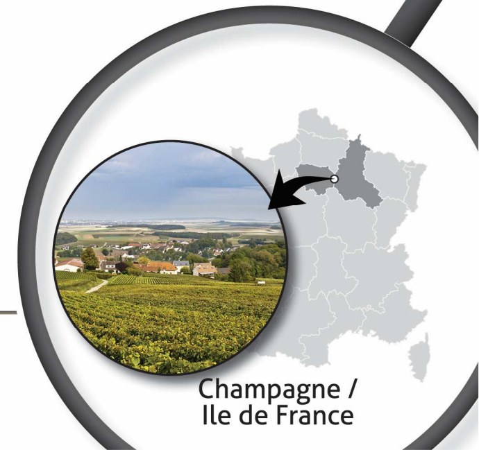
Champagne / Ile de France